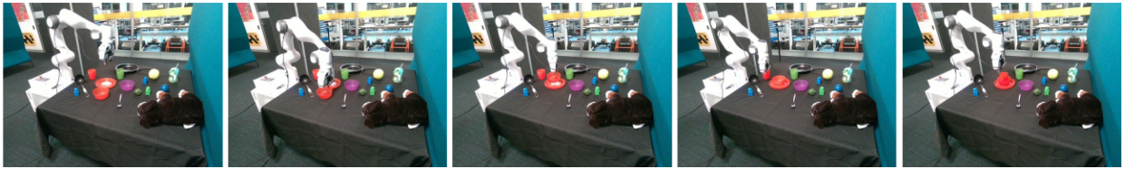
Fig. 2: Sub-tasks decomposition of a Place the bowl on the plate and the cup in the bowl matching the color sequence.